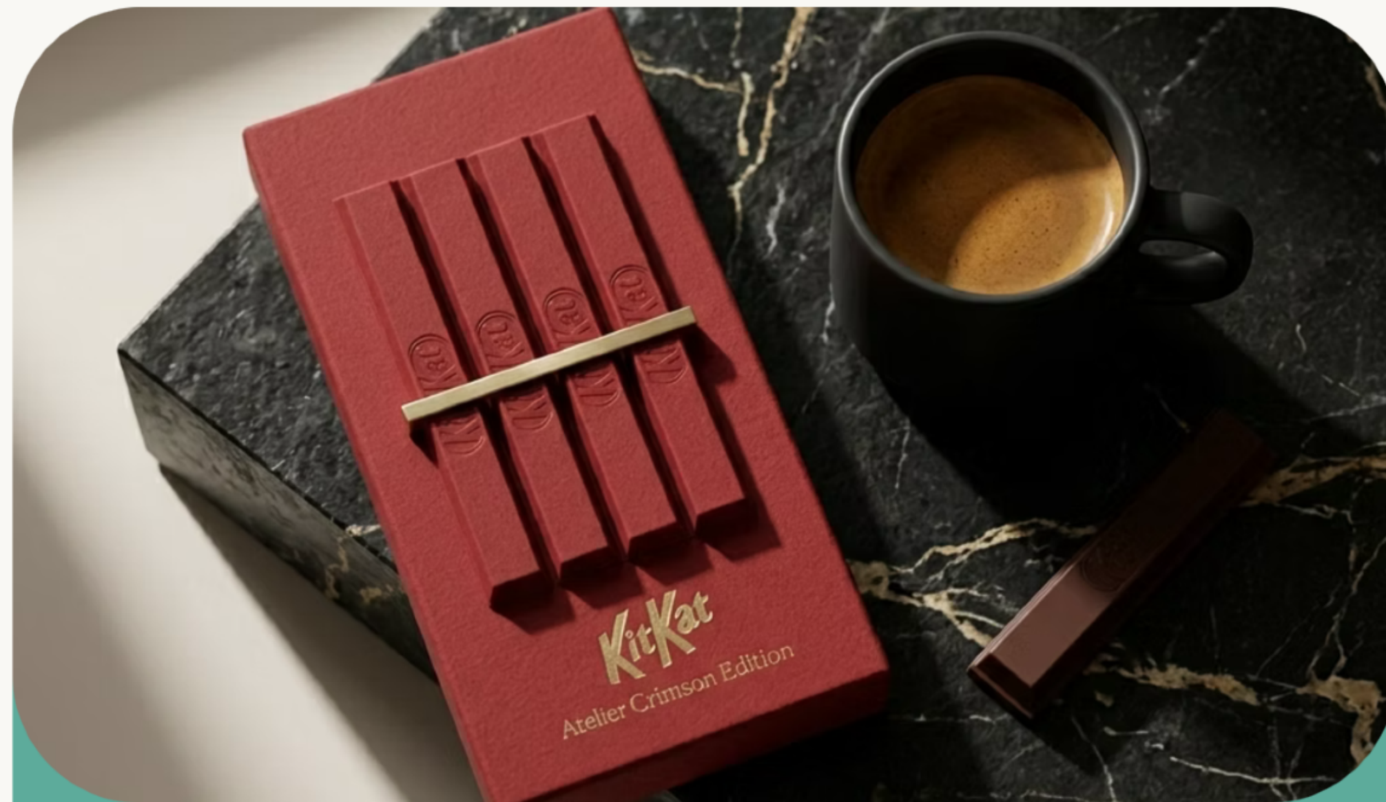
KIT KAT PREMIUM CONCEPT

Menta has undertaken some existing concept design showcasing our abilities for your next growth project