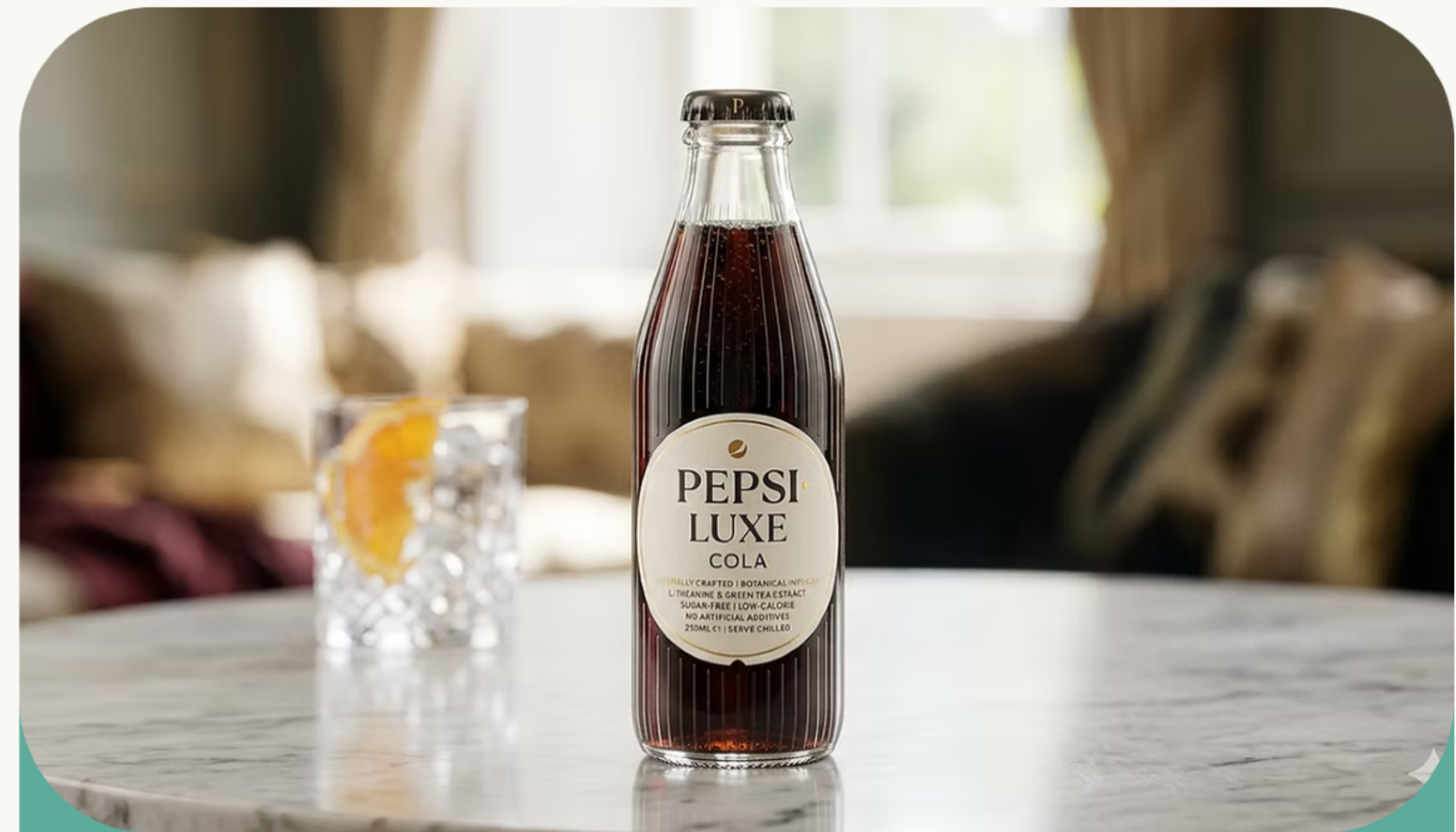
PEPSI PREMIUM CONCEPT